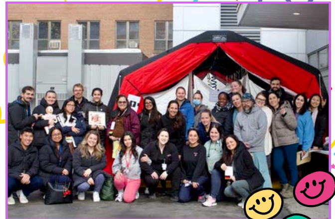
MGH - Emergency Group Wink