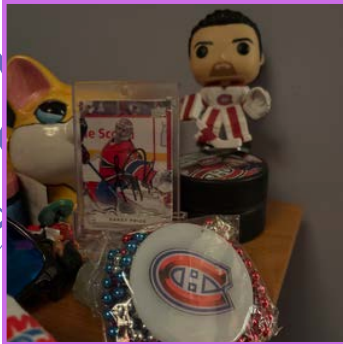
RVH-B3 Cath Lab Habs Game Night!