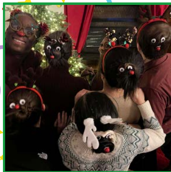
RVH - Centre de jour Team bonding event