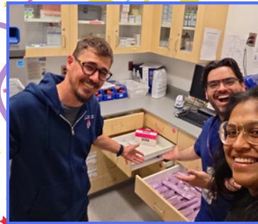
RVH Emergency Medication cart