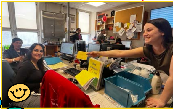
MGH - 15th & 17th Medicine Surprise act of kindness

Challenges tackled, laughs shared, and team spirit shining through – a look back at some highlights from the Ultimate Challenge!