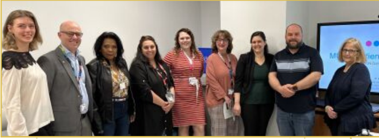
The Patient Support Line Team Transversal

The Patient Support Line team plays a key role in supporting adult patients transitioning from hospital to home. Present during often critical moments, the team provides reassuring support while helping to reduce unnecessary emergency visits.