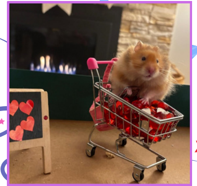
MCH-Day Center Wild pets