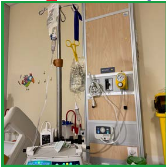
MCH-PACU The Unit's MacGyver