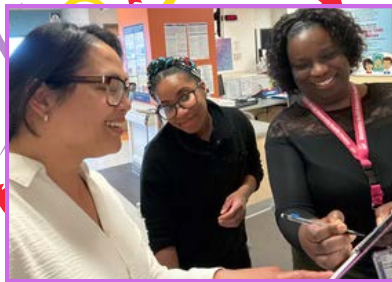
Tiny Toes Territory-DO6 Walking Meeting