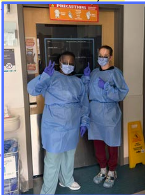
HME-PICU Full PPE