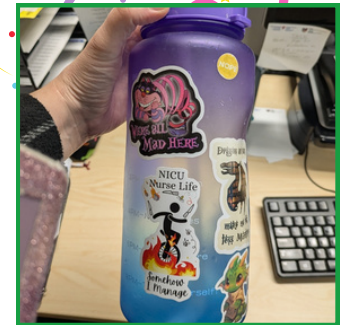
MCH-Ambulatory Clinics Unique or funny sticker