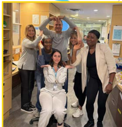
MGH - 4th Psychiatry All heart