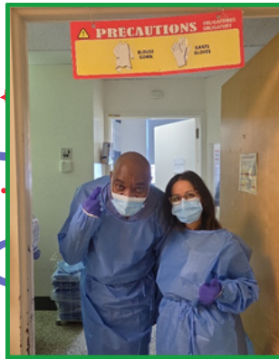
Lachine 4th-5th Medicine Full PPE