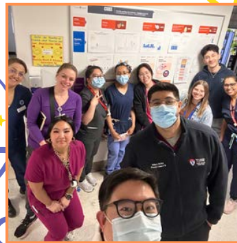
Trans-PCI Infection prevention and control CSISS huddle