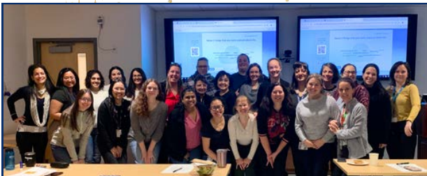
Adult Nurse Educators MGH, Glen, Lachine and the Neuro

This team is recognized for its leadership in redesigning the MUHC's Central Nursing Orientation. In response to learner feedback and evolving clinical needs, its members developed the "Bridge to Practice" program, a hands-on, and engaging orientation designed to build confidence and better prepare new staff for practice. Since April 2025, this initiative has transformed the learning experience of nearly 250 new nurses, CEPIs, CEPIAs, and LPNs.