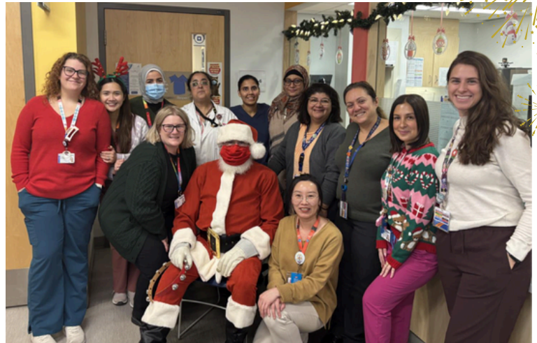
Pediatric Test Center, MCH