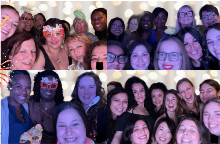
Women's Health Mission