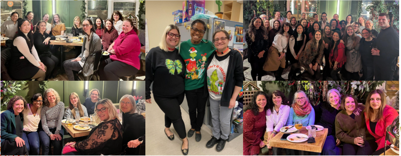
ICCAN/Complex Care/PDC, MCH

A big thank you for sharing your beautiful holiday photos! Your smiles brought so much joy to our first newsletter of the year. Wishing you a year filled with energy, teamwork, and wonderful successes. May 2026 inspire you to keep making a difference every single day!