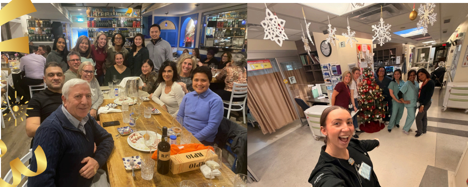
Coronary Intensive Care Unit - MGH