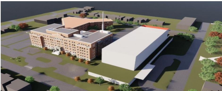
A volumetric view of our future hospital!