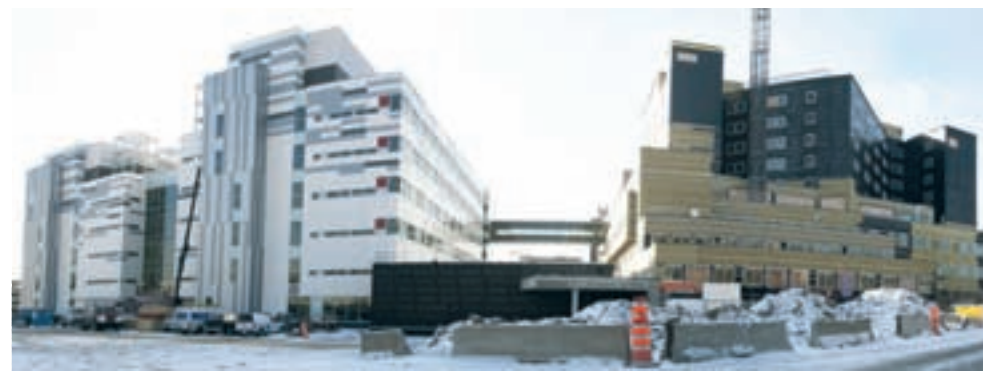
View of the Research Institute and Cancer Centre