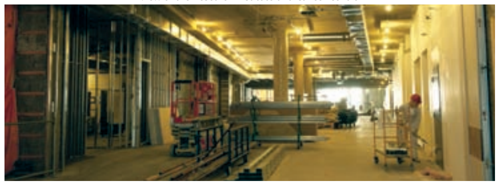
Inside at the Glen, crews are already painting.