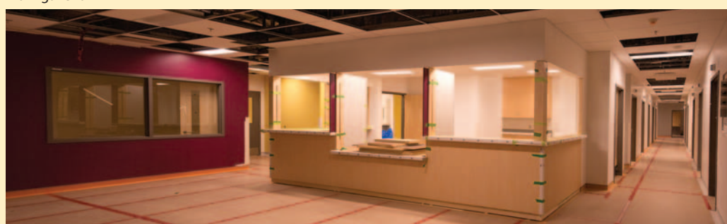
Reception area for Montreal Chest Institute clinics

Block E: MUHC Research Institute Blocks C-D: Royal Victoria Hospital Montreal Chest Institute, Cancer Centre Blocks A-B: Montreal Children's Hospital