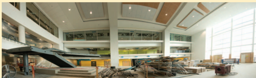
Montreal Children's Hospital Atrium